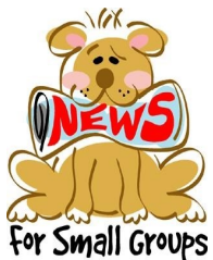
For Small Groups

The next meeting date is Monday, February 22 at 1:00pm in the church parlor.. This is a great group who enjoy getting together to share their gifts with others.