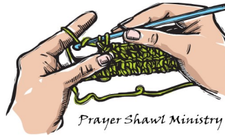
Prayer Shawl Ministry

This small but mighty (and fun) group knits and crochets: