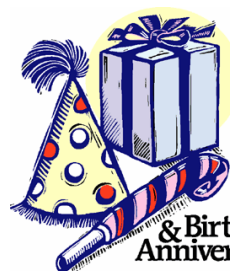
& Birthdays Anniversaries